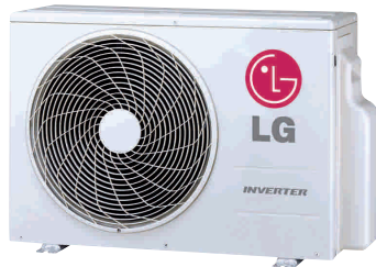
MU2M15 UL2 MU2M17 UL2