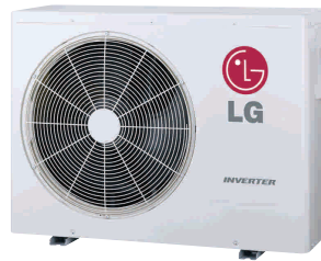
MU3M19 UE2 MU3M21 UE2