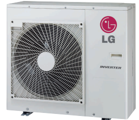
MU4M25 UE42 MU4M27 UE42 MU5M30 UE42